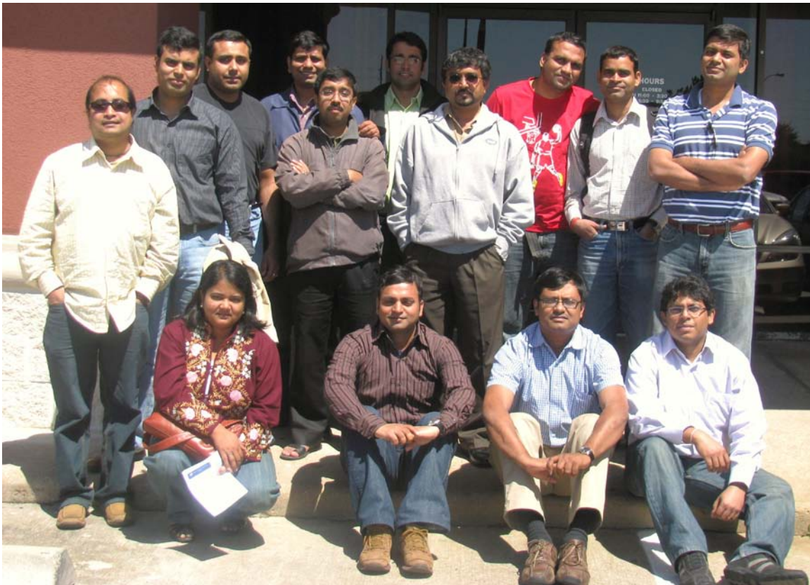
Picture 1: SPG-North American chapter members who attended the meeting.

Fourteen members of Society of Petroleum Geophysicists North America Chapter (SPG-NA) met at Mantra Indian Restaurant in Katy, TX on March 28, 2009 between 12 – 2:30 p.m. The meeting was very upbeat and the members recognized the activities of SPG-NA. The members also agreed on continued efforts and initiatives of SPG-NA to build up a strong geoscience community amongst practitioners of the profession in India and abroad. During the meeting the fourteen members put in a total of $390 (12 x $30 + 2 students x $15). Of this amount $227.50 was used to defray the costs of buffet lunch and $162.50 has been put aside in the SPGNA fund pot.